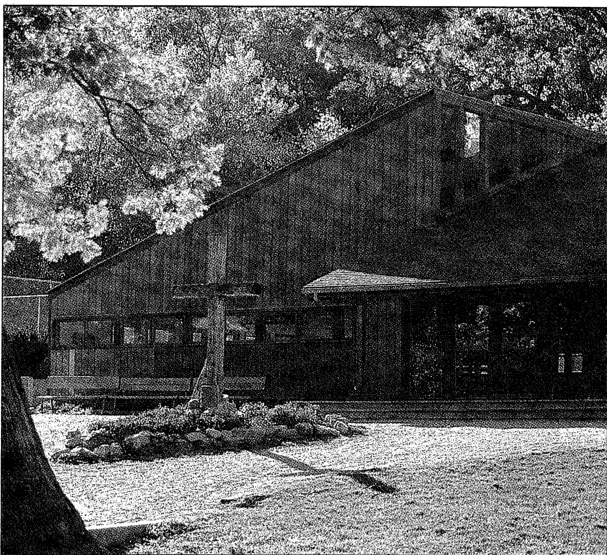
The dining hall at the Lutheran Outdoor Ministries Center, Oregon, Ill. The center is part of the ministry of Evangelical Lutheran Church in America congregations in Illinois and Missouri.

HOLY CROSS LUTHERAN CHURCH SUNDAY MORNING WORSHIP SERVICE May 26th, 1991 Worship Services 8:15 & 10:45 a.m.