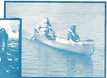
Guests canoeing on Paul's Pond