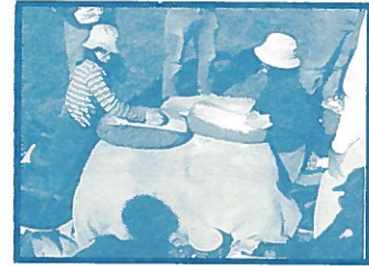
Grinding corn using a mano and a matate