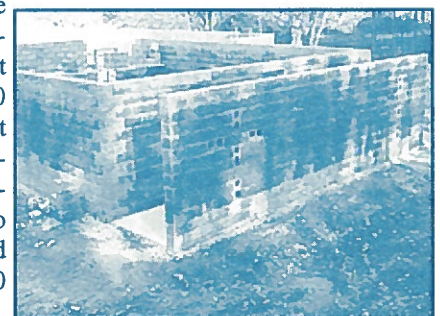
The new LOMC Bathhouse goes up!