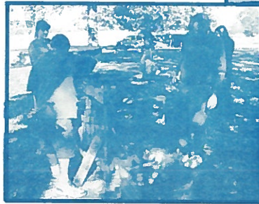
Making cider the old fashioned way