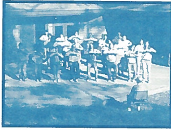
The LOMC Swing Choir Tour