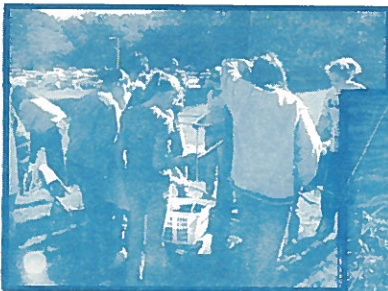
Kids and adults making hand dipped candles and corn husk dolls