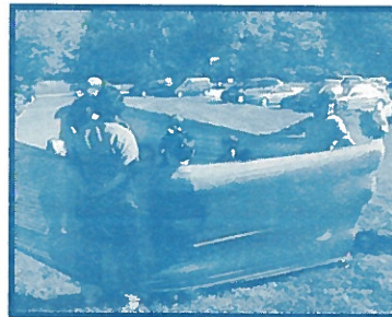
Fun in a lycra tube